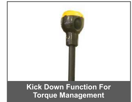
Kick Down Function For Torque Management