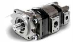
Casappa (Italy) pump