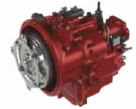
Carraro (Italy) Transmission