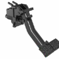
Carlisle Brake (USA)