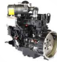
100 HP Perkin's Engine