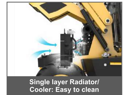
Single layer Radiator/ Cooler: Easy to clean