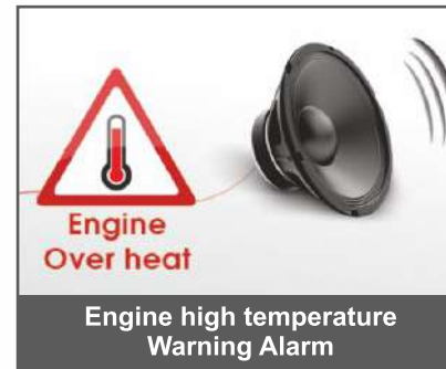
Engine high temperature Warning Alarm