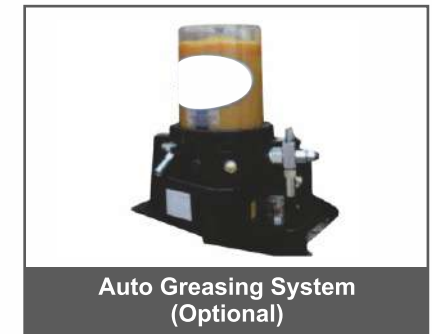
Auto Greasing System (Optional)