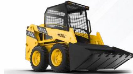
SKID STEER AV 490

BULL MAKING INDIA PROUD Now in 46+ COUNTRIES