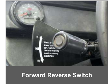
Forward Reverse Switch