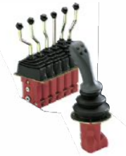
Hydro Control Walvoil (Italy) Valve