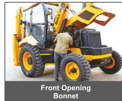
Front Opening Bonnet