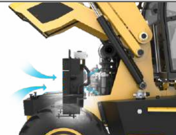
AKG (German) Radiator Cooler